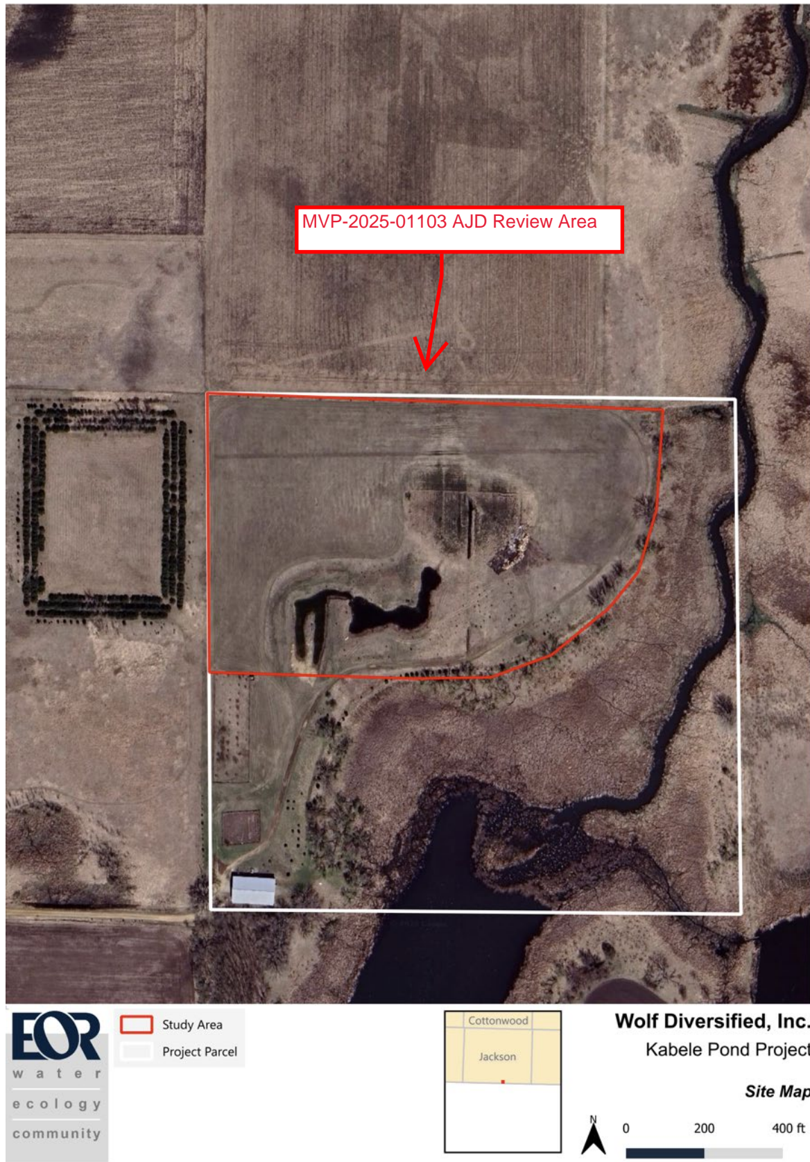
Figure 1. Study Area.