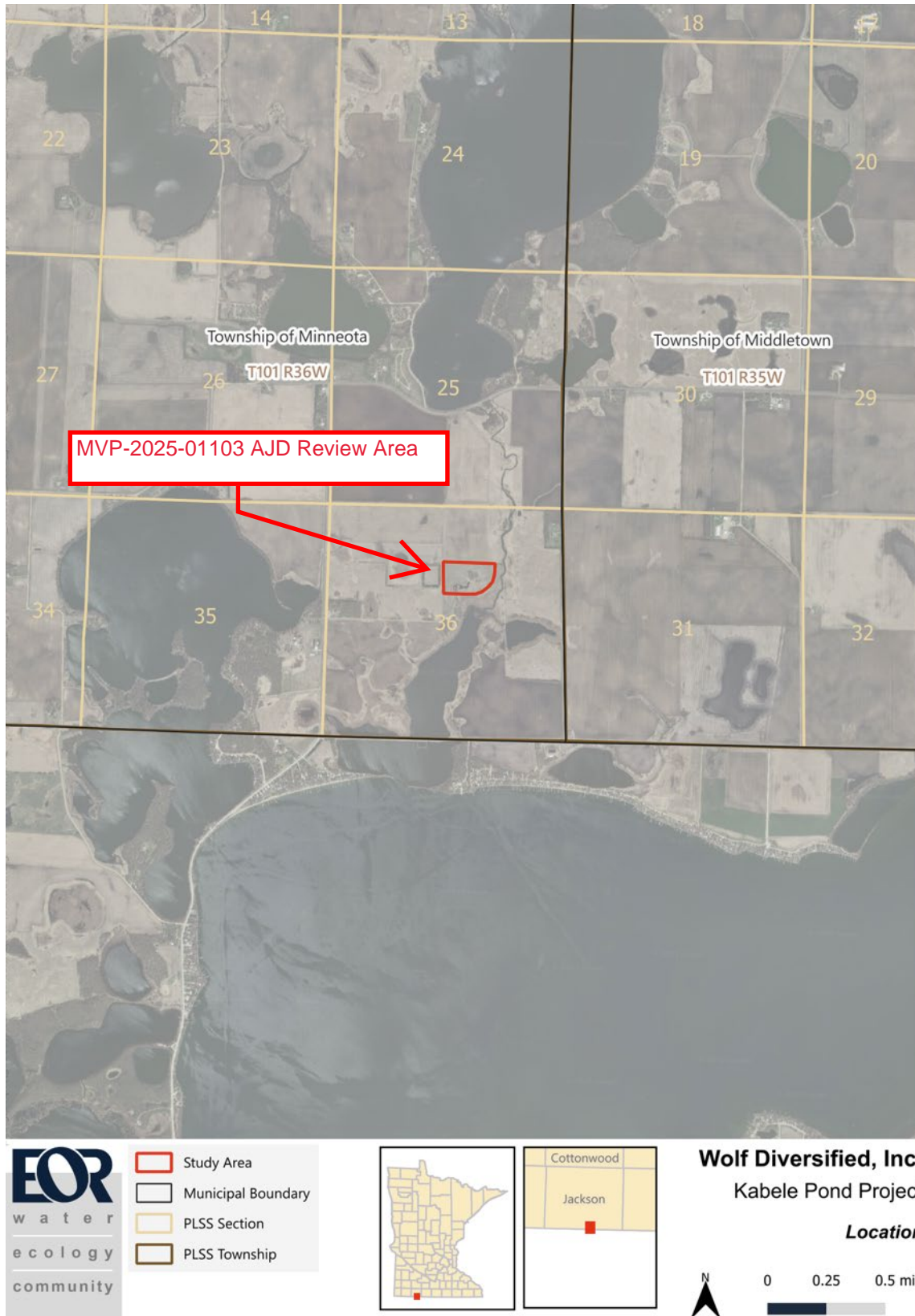
Figure 2. Kabele Pond Project is located between 480 th and 490 th Avenues north of Spirit Lake in Jackson County, Minnesota.